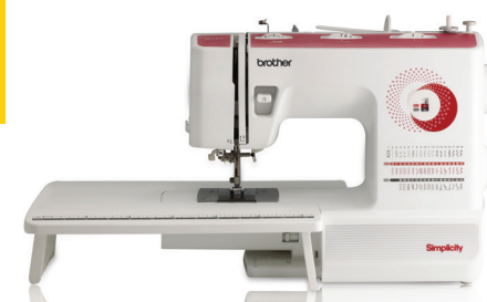
SB530T - Simply Elegant