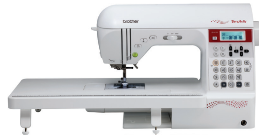
SB4138 - Simply Inspired