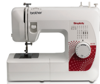
SB170 - Simply Affordable