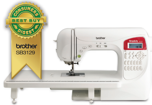
SB3129 - Simply Creative