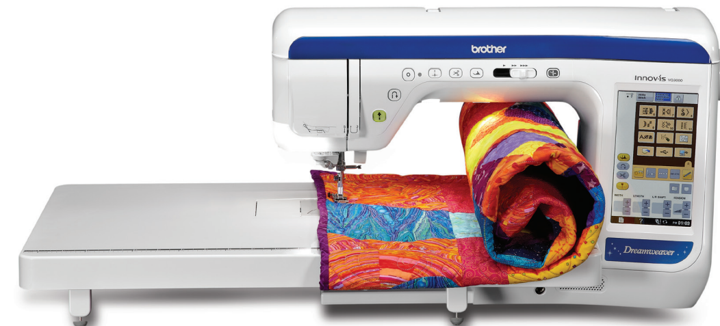
DreamWeaver™ Innov-is VQ3000