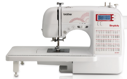
SB700T - Simply Brilliant