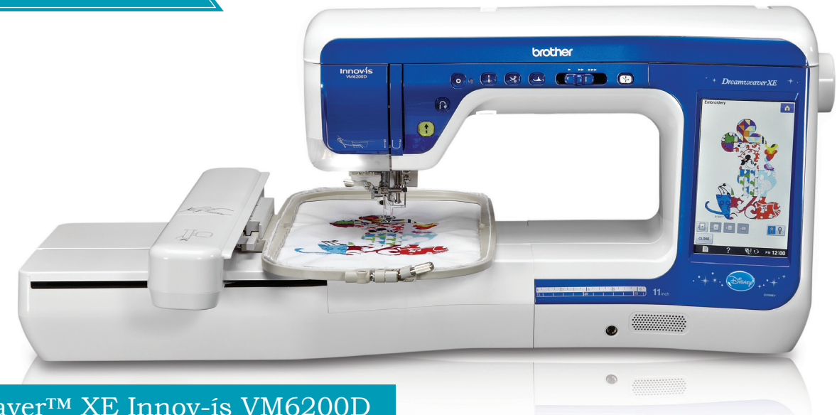
DreamWeaver™ XE Innov-is VM6200D